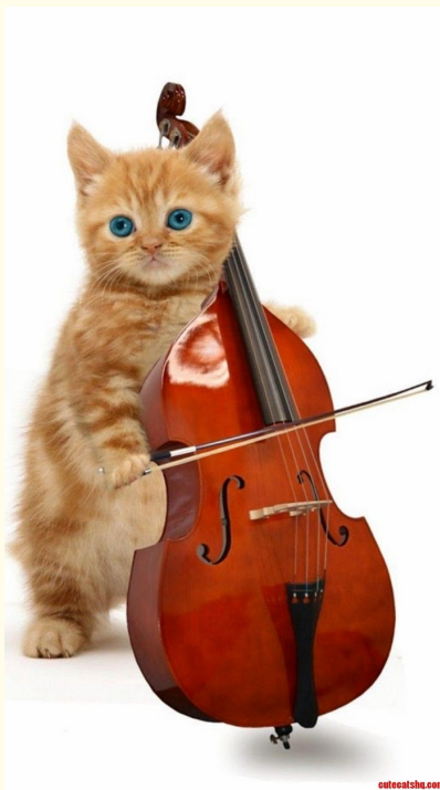
Figure 1: This is a sample figure!