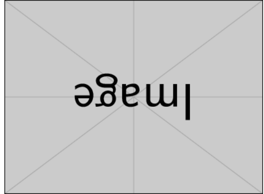
Figure 1. Always give a caption.