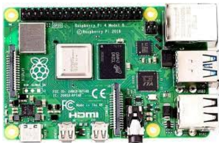
Figure 6.2: Raspberry Pi.