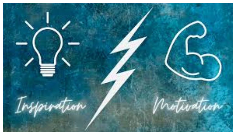
Figure 2.1: Motivation.

Explore your area of interest and work on such projects- Usually, we tend to take projects which don't match our sense of interest. So we suggest you take up projects that match your interest to help you dive deep into the concepts. Assume and take up responsibilities; participate in group discussions to enhance your knowledge. Takeup projects that are research-based and industry-oriented add value to your resume. Let us explore various points which depict why final year engineering projects are important, which are as follows: