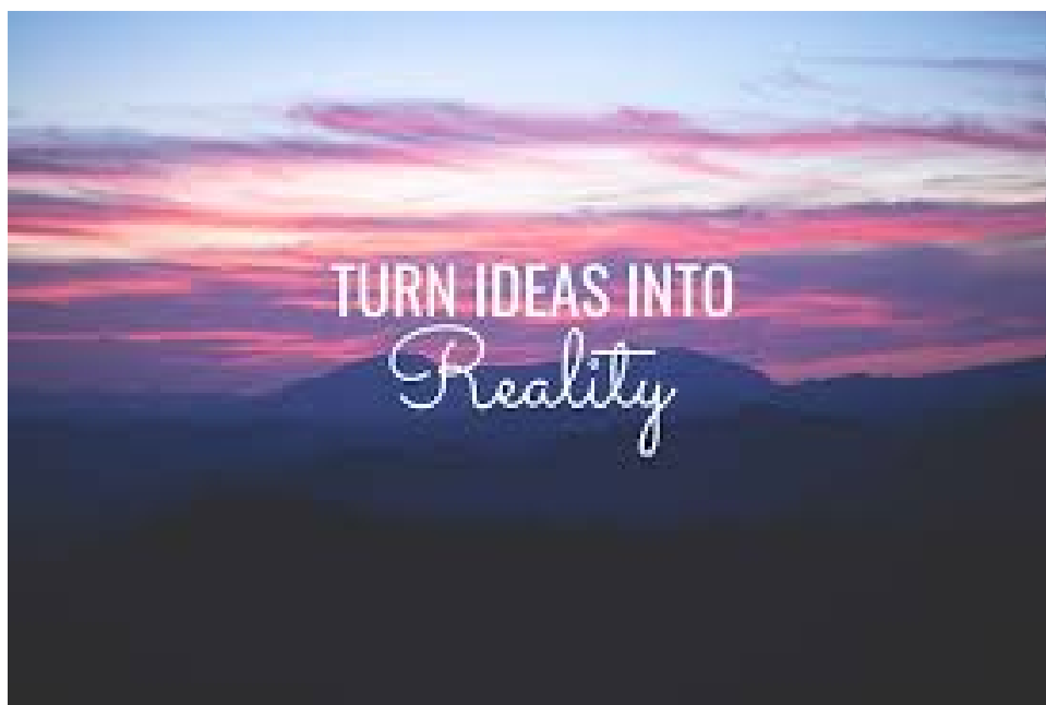
Figure 2.2: Ideas to reality.

As engineering students, you can enhance and boost your creativity and work on various projects that suit your interests. It helps students be aware of various technological trends the feasibility of completing the final year project. It helps students see the project from a larger vision and helps to ignite ideas for compelling startups or projects.